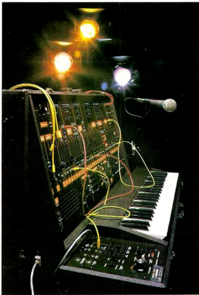
Studio facilities courtesy of Intermedia Sound, Boston, MA

In the latest Billboard * survey, U.S. recording studios reported that they prefer ARP synthesizers over any others. By a 2 to 1 margin.